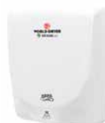
Aluminum , White