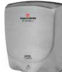
Stainless Steel , Brushed