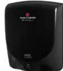
Aluminum , Black