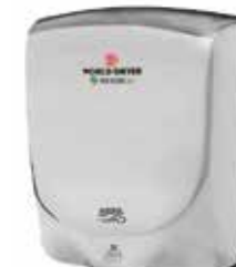
Stainless Steel , Polished